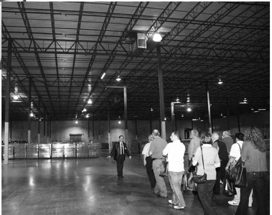
Gleaners' staff took attendees on tours of the new 297,000 square-foot warehouse.