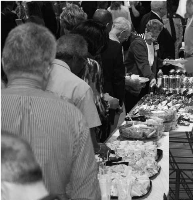
Celebration goers enjoyed lunch provided by the Kroger Company!

Gleaners' staff gave tours of the 297,000-square-foot food warehouse that has over three times the floor space of the former facility. The energy-efficient, high cube, temperature controlled warehouse allows maximum storage and has a built-in 35,000-square-foot commercial refrigeration unit that is more than adequate for Gleaners' food storage needs.