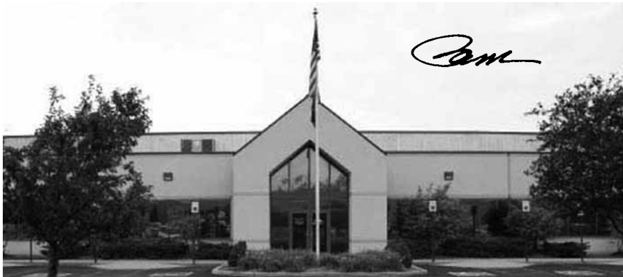
Gleaners new home located at 3737 Waldemere Avenue on Indianapolis' southwest side.

MISSION STATEMENT Gleaners' mission is to end hunger by engaging individuals and communities to provide food for people in need.