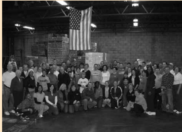
Downtown Rotary Club of Indianapolis members, family and friends gathered at Gleaners' former warehouse facility.

• On March 13th, the Downtown Rotary Club of Indianapolis broke a Club record as 88 members, family and friends volunteered at the food bank. They spent their Saturday morning packing 1,371 food boxes for seniors and 561 bags of food for Gleaners' BackSacks...Weekend Food for Kids program!