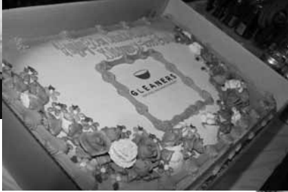
The Pacers' Boomer, Indiana Fever's Freddie Fever and the Indian's Rowdy helped cut the cake and entertained the crowd after the ribbon cutting!