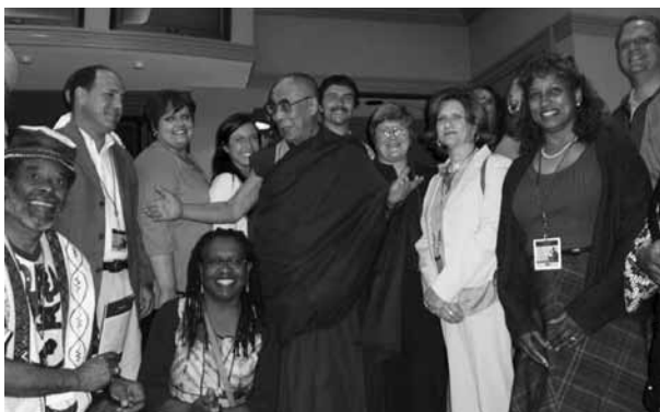
The Dalai Lama with members of the Interfaith Hunger Initiative at Con-seco Fieldhouse.

• Over 9,000 people filled the seats at Con-seco Fieldhouse on May 14th to hear the Dalai Lama speak. His public talk was presented by the Tibetan Mongolian Buddhist Cultural Center, Indiana Buddhist Center,